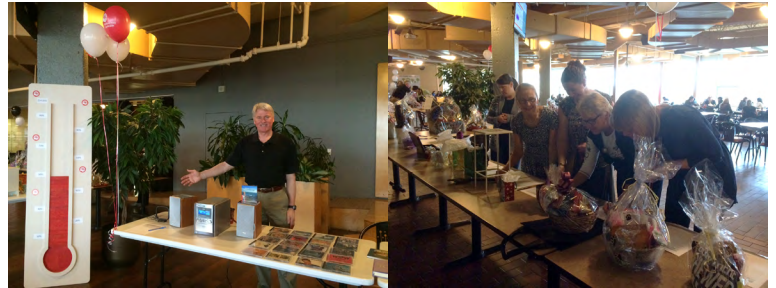
St. Lawrence College - Silent Auction