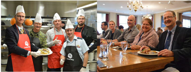
RMC - Campaign Touchdown Luncheon