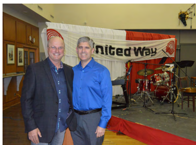
RMC - RMC's Got Talent