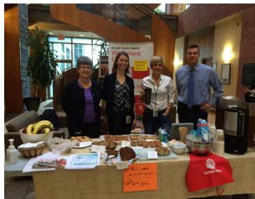
KFL&A Public Health - Good Morning Coffee