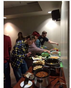
Bell Media - Potluck