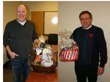
Ministry of Environment - Silent Auction