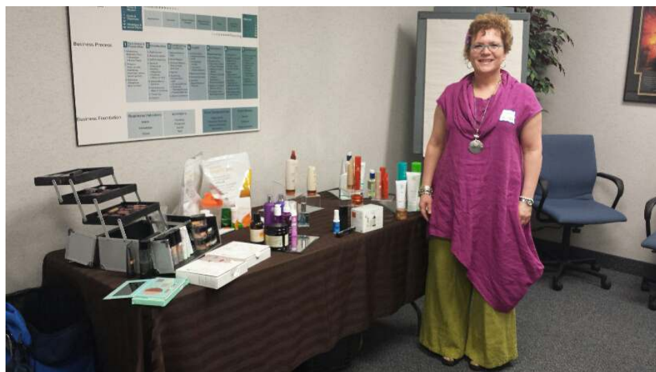
United Way Ladies Lunch at Investors Group, 2014