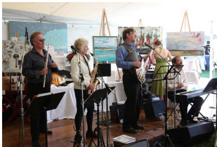
Fare for Friends 2013

Tickets are $160.00 with a tax receipt available for a portion of the price. Order yours today.